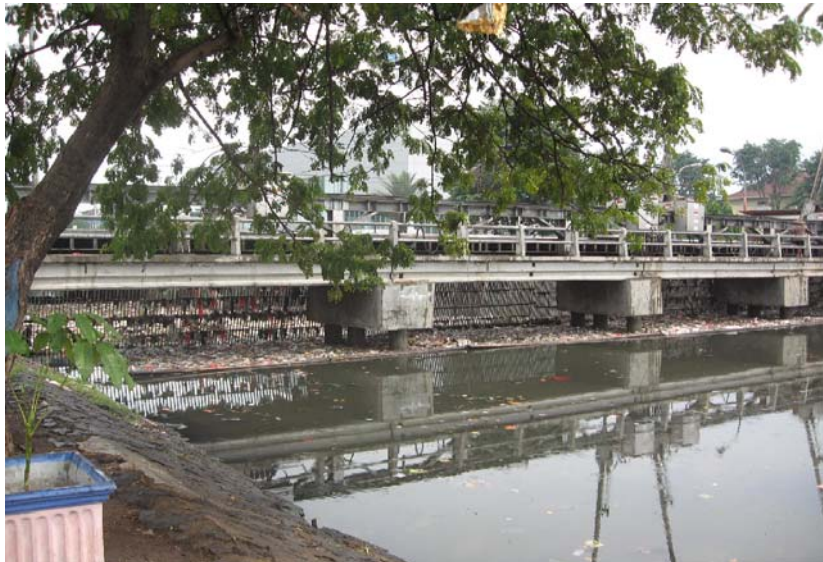
Build-up of solid waste at channel filter installation