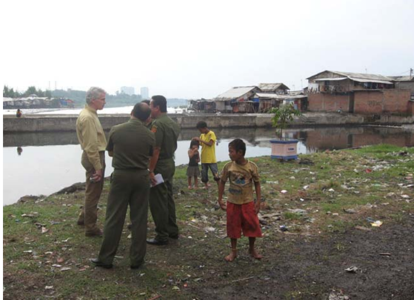
NCEA working group expert meets with DKI experts on location