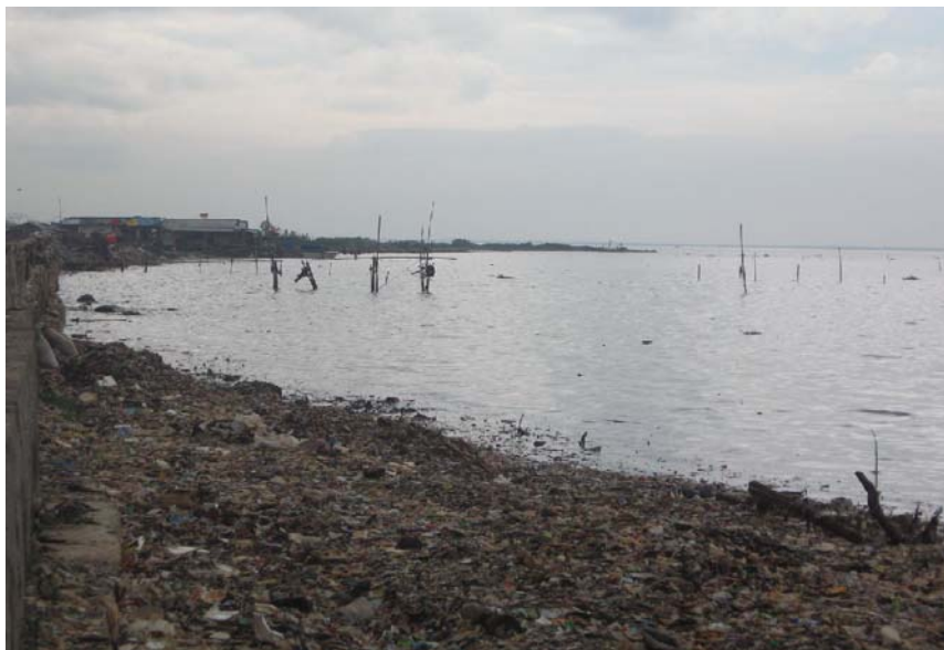
Waste deposited in Jakarta Bay by drainage channel