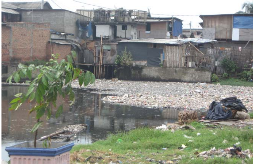
Settlements on bank of waterway