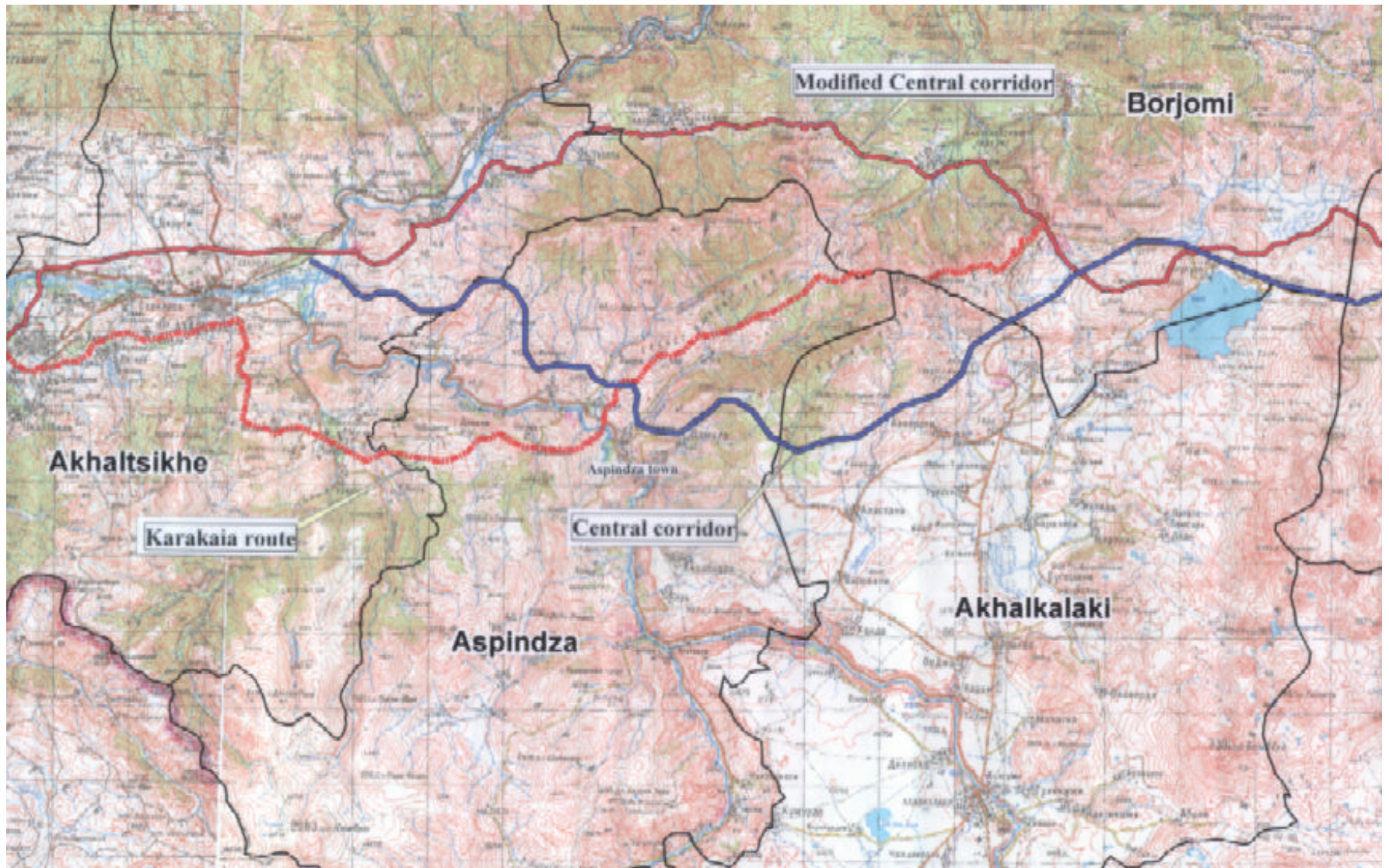
Map 2: Overview of the three selected routes crossing the Santskhe-Javakheti region