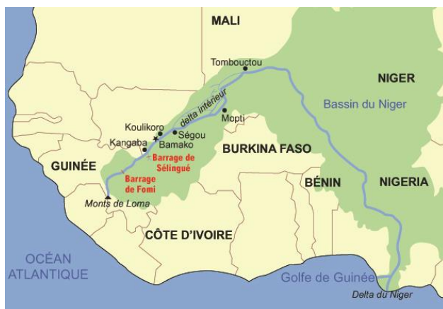
Location of the Niger basin and Sélingué dam

To face these many challenges and contribute to the achievement of the objectives of the Strategic Framework for Economic Recovery and Sustainable Development in Mali (CREDD 2019-2013) and the Sustainable Development Goals (SDGs), the communes of Baya, Sankarani and Tagandougou have decided to set up a federating collaboration framework: the Intercommunalité du Bassin du Sankarani . With the support of VNG International and the Netherlands Commission for Environmental Assessment (NCEA), the three municipalities are currently developing a vision of sustainable development through their Programme for the Integrated and Sustainable Development of the Sankarani Basin (PDIDBS) and its Strategic Environmental Assessment (SEA).