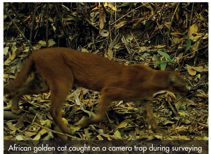
African golden cat caught on a camera trap during surveying

The Wambabya and Taala Forest Reserves, as well as all rivers, are legally protected areas of high sensitivity that support plants and animals of conservation importance. The rivers crossed by the pipeline are the Wambabya tributary, the Kafu and two tributaries, the Nabakazi and two tributaries, the Katonga, Kibale and Jemakunya.