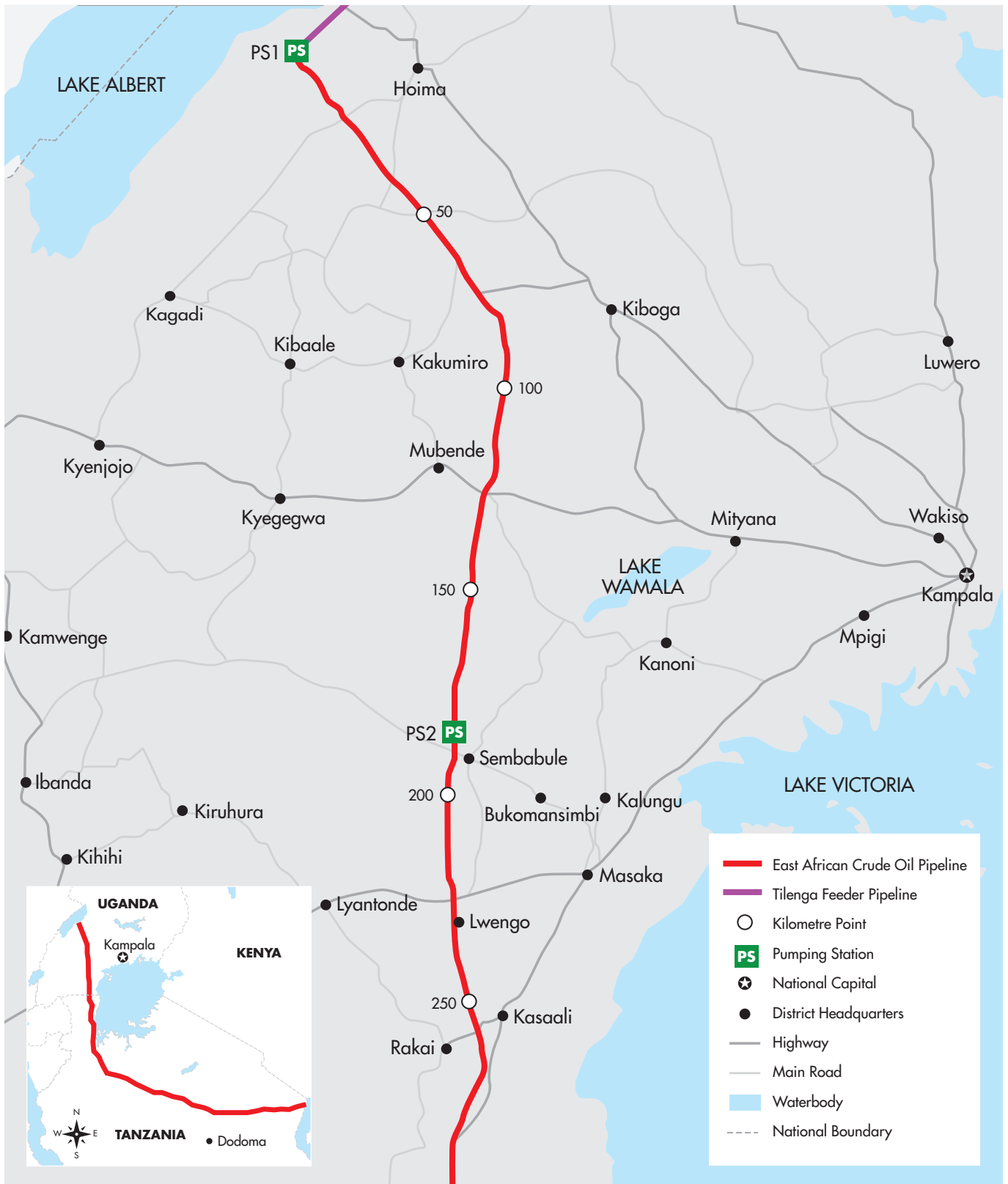
FIGURE 1: The EACOP Project

MEASURES TO AVOID OR REDUCE NEGATIVE IMPACTS ARE DESCRIBED, AND AFTER THE MEASURES ARE APPLIED, THE PREDICTED REMAINING IMPACTS ARE DESCRIBED.