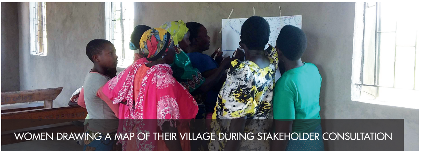
WOMEN DRAWING A MAP OF THEIR VILLAGE DURING STAKEHOLDER CONSULTATION

The ESIA focused on the impacts on 'valued environmental and social components' (those features considered to be important by society) and their associated benefits to humans