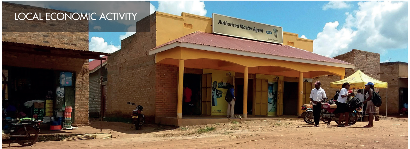
LOCAL ECONOMIC ACTIVITY