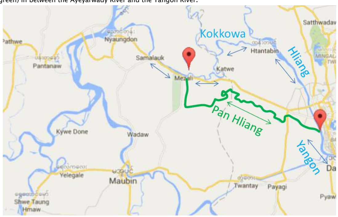
Figure 1: Plan view of Pan Hlaing River (the river section that is directly related to the project is shown in green) in between the Ayeyarwady River and the Yangon River.

Figure 2: A sketch impression of Pan Hlaing Sluice looking towards the Pan Hlaing River. Source: Final Feasibility Study Pan Hlaing Sluice, Myanmar, 8 April 2016):